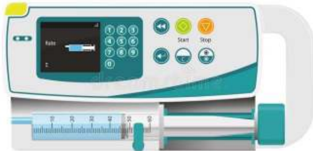
For illustration purposes only